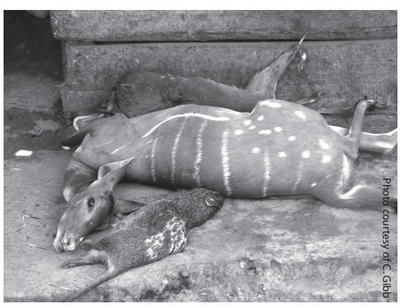
Antelope and Grasscutter in Ghana