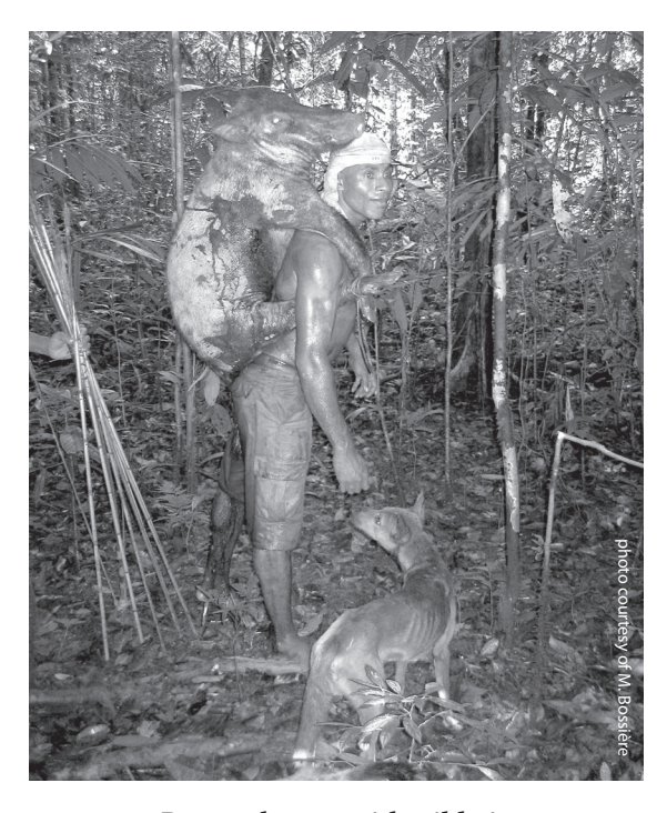
Papuan hunter with wild pig

• Wild pigs ( Sus spp., Potamochoerus sp, etc.) and some antelopes are among the most active seed predators. A significant change in their population densities will have a major effect on seedling survival and forest regeneration.