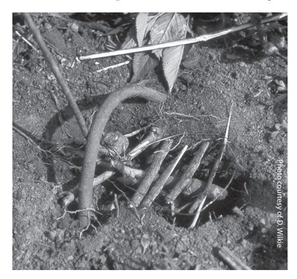
Snare used for trapping

Hunting rules and regulations exist almost everywhere but they are rarely enforced. There is clearly an ownership and management problem. The State is the owner of the resource and issues rules and regulation to manage it but the State is unable to enforce its decisions. A law that is not enforced undermines the authority of the government, and a law that can only be enforced at great cost and difficulty might need to be revised. There is much work to be done in order to tackle this issue in most tropical countries. The range States<sup>6</sup> and their donors need to take a radical look at all types of natural resource policies with the clear aim of enhancing the rights and sustainable livelihoods of rural dwellers. In Asia, the example of Sarawak (Malaysia) gives some cause for optimism. A Master Plan for Wildlife in Sarawak has been developed based on long-term research and has resulted in the passing and strict enforcement of a new law banning all trade in wild animals and their parts, strict control of shotgun