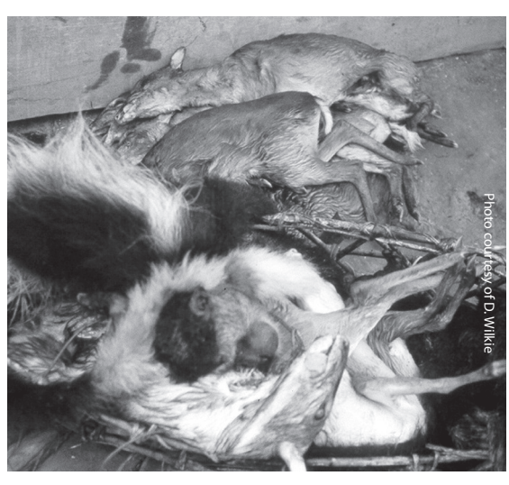
Small ungulates - one day catch - Congo