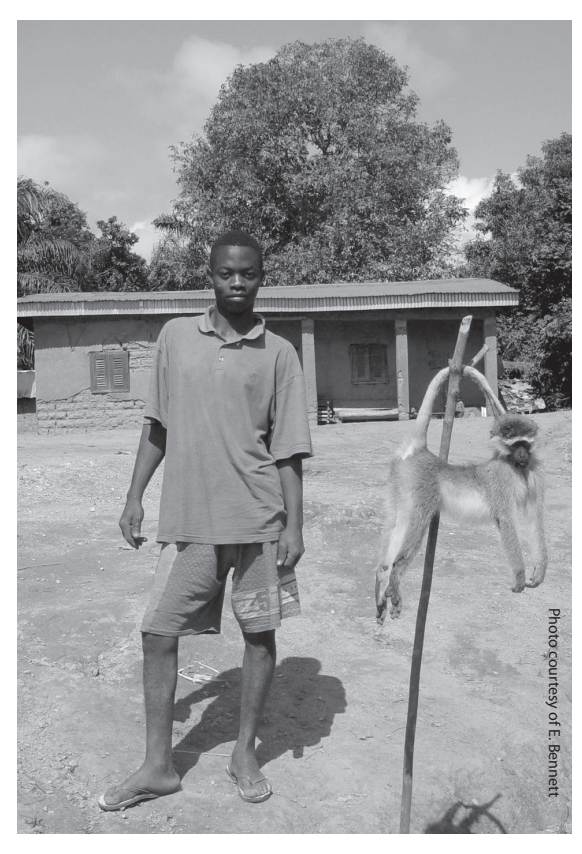
Bushmeat seller and vervet - Cameroon

economically viable to do so and this may eventually lead to species extirpation. This situation can occur in cases where two [or more] species are hunted simultaneously. While one species might be too scarce to be actively hunted, it would none the less be worth the kill if it was found during the course of hunting for another species. One example of this type of opportunistic hunting can be seen in the interactions between the rhinoceros and elephant hunts. While rhinos were too rare to be economically hunted by poachers, their presence was a bonus as it allowed them to opportunistically kill one while actively hunting elephants (Bulte 2003).