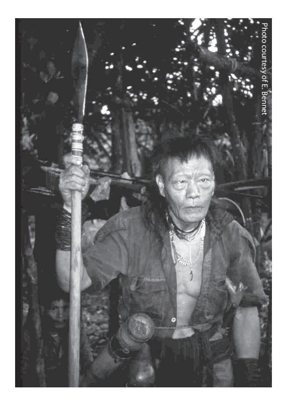
Penan with Blowpipe - Sarawak, Borneo

In several cases, meat sharing among members of the community does not seem to play a large role