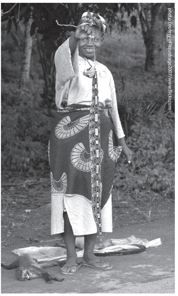
Bushmeat vendor in Cameroon