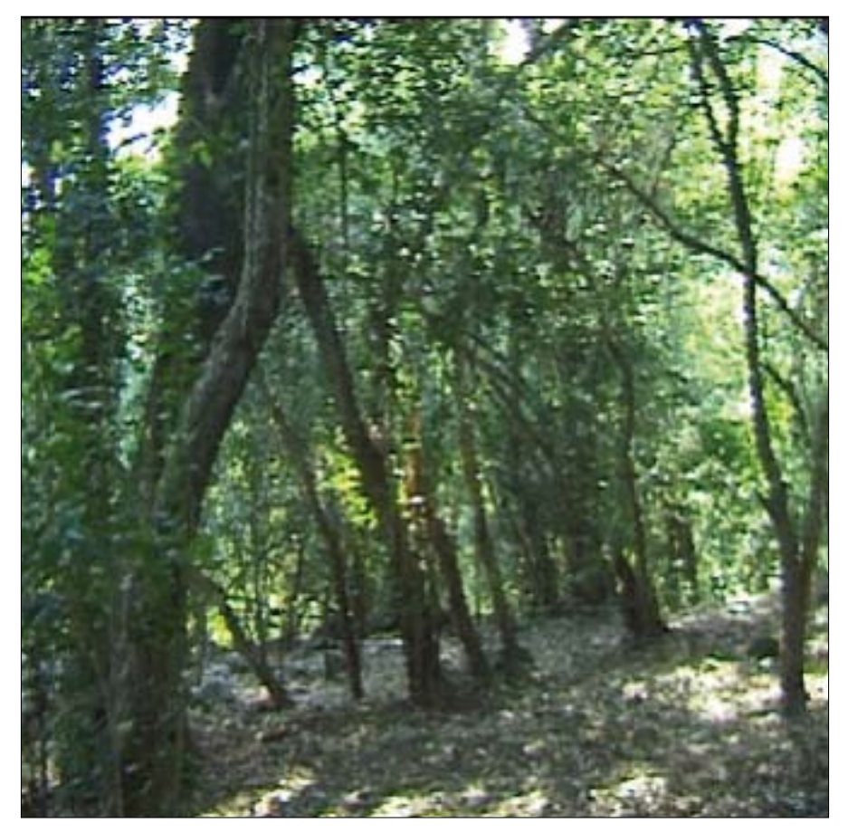
Kinga shrine in Mfangano, western Kenya, an example of the role that indigenous knowledge plays in nature conservation. Though shrines were generally used as locations for worship and communication with ancestors and gods, they also provided a sanctuary for a variety of indigenous trees, plants, animals, birds and insects. They indirectly contributed to the conservation of biodiversity

which had stood the test of time; they saw no need to tinker with what had served them so well for generations.<sup>18</sup>