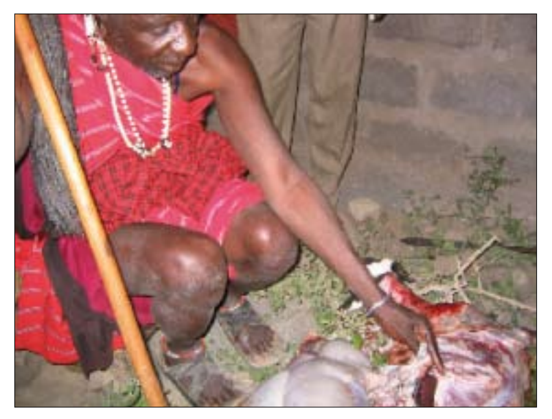
A Maasai elder reading signs on a goat intestine. Specialized elders could divine drought and famine, social conflicts, diseases, childbirth, peace or war by examining the insides of a goat.

The appearance of swallows and other similar birds such as narmo, dudumizi and demsi during September-October meant low amounts of rainfall and possibly drought in the following season. The appearance of pugi-wanda, the blue-spotted wood dove and ekyenselikola, a sunbird, meant impending long drought and famine. In Muheza District of Tanga, the appearance of armyworms meant delayed rainfall. If large swarms of red ants appeared in October-November, if large swarms of bees appeared flying from hills to lowlands, and if a large number of moist anthills appeared in August-September, these were signs that the season was going to be wet. However, the overabundance of swarms of armyworms in September-October heralded drought. Other items used in prediction and early warning in Tanzania included vegetation and the flowering of such trees as the Nandi flame tree (Delonix regia) and mangoes, air movements and temperatures, underground rivers, clouds and celestial bodies.