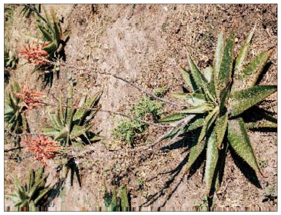
The Swazis use lihala (Aloe saponaria) to make preparations for treating high blood pressure, bile with nausea, fever and lethargy, snake bite, colon irritation, stomach ache. Ash from the leaves of the lihala can be used as cooking soda and as an ingredient for snuff, used by adults only.

drugs; the use of herbal medicine is the only option. Herbal remedies are used to treat a wide range of diseases in humans as well as in animals. These include such diseases as anaemia, cancer, chest pains, dizziness, glaucoma, heartburn, infertility, malaria, venereal diseases, gynaecological problems, skin diseases, toothache, diarrhea, vomiting, and so on. Treatment also includes life-threatening diseases associated with HIV/AIDS. Treatment of fractures is also done with traditional mixtures (umhlabelo). The Swazis are a livestock-keeping people and veterinary remedies also exist to cure animal illnesses.