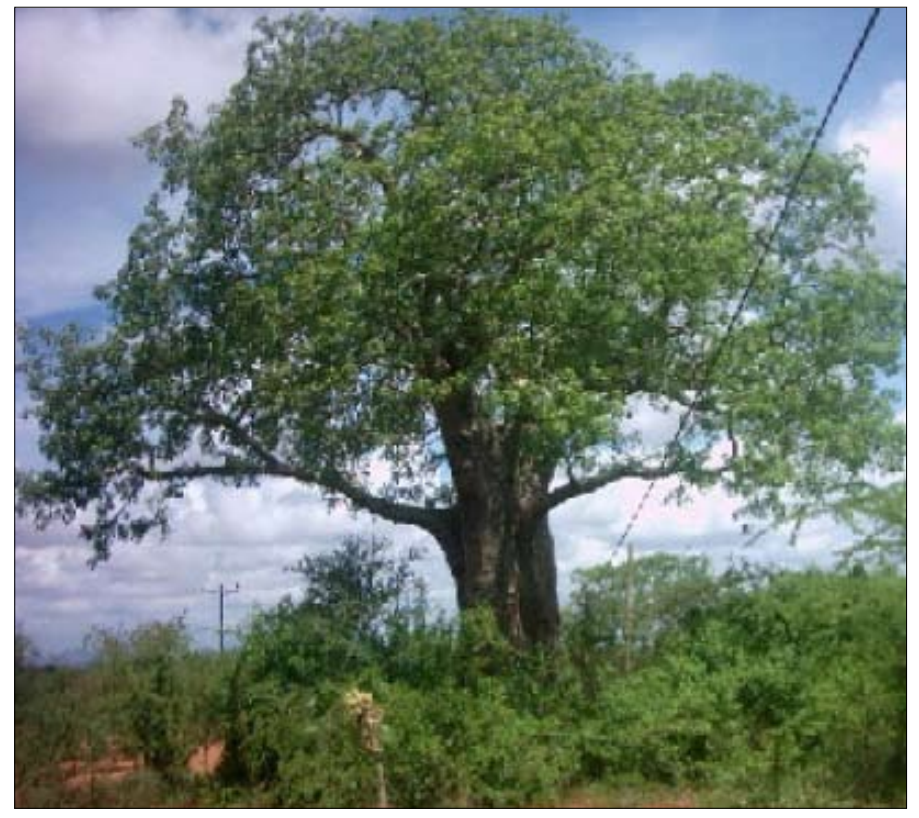
The baobab is one of the most important plants used as indigenous early warning indicators of rainfall and drought

Famine and food insecurity, caused mainly by drought and floods is a major concern in all the countries. Famine, of course, can also be caused by other disasters such as invasion of locusts, armyworms and other pests and diseases. However, most incidences of famine are associated with drought.