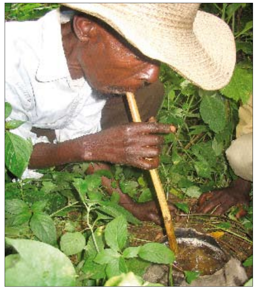
A member of the Nganyi clan in western Kenya, well known for their rain-making powers and weather prediction. He is blowing into a special pot, used for monitoring daily weather, that is over 100 years old.

There is also the story of the Kikuyu farmers in Kenya who rejected European farming techniques at the turn of the 20th century that were being promoted by British agricultural officers. The Kikuyu farmers preferred their own agricultural knowledge