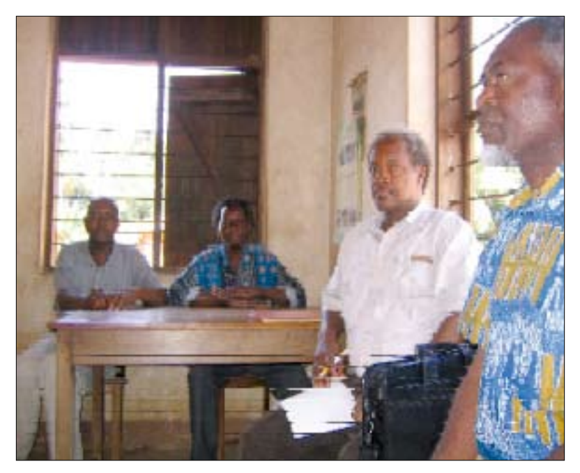
A group interview in Ndondondo village, Muheza District of Tanzania.