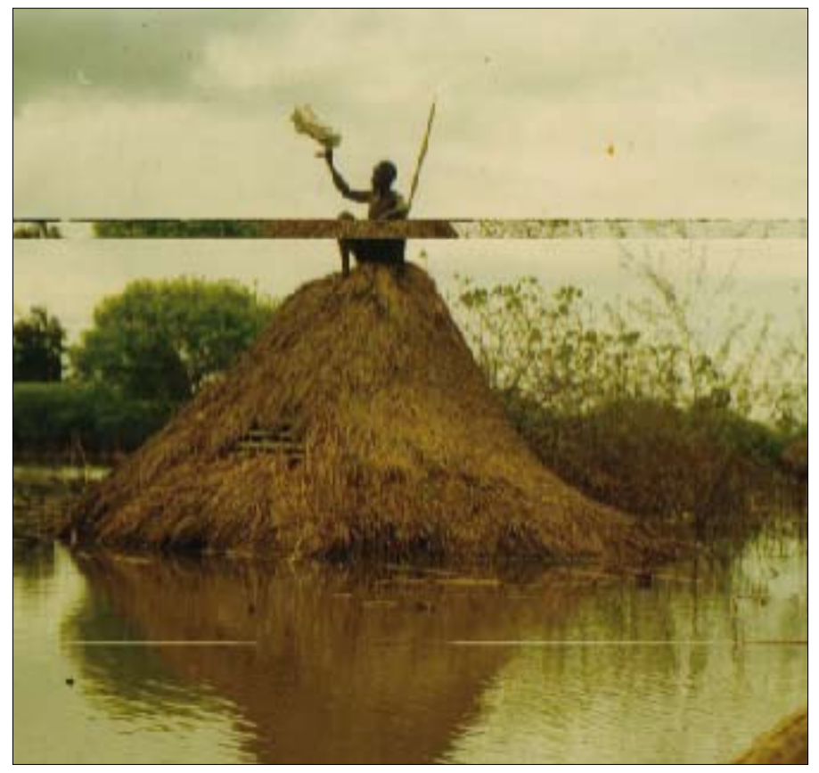
Periodic floods are some of the most common natural disasters

to human misbehavior. Consequently, mitigation is sought in acts of repentance "to restore the divine balance".<sup>45</sup>