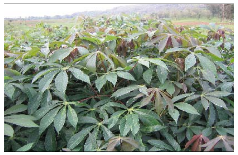
The cassava was important for famine preparedness. In some communities a cassava plantation was a "must-have".

floods. When floods are likely to occur the nesting of the emahlokohloko is very high up the trees next to the river and when floods are unlikely the nests are low down.