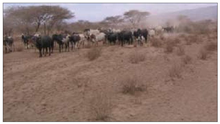
Cattle being moved from Masika to Kiangazi in Tanzania: Pastoralists move their herds throughout the year to optimize utilization of rangeland resources for maximum meat and milk production.

rangeland resources for maximum meat and milk production. As a result of well organized livestock movement, the herds stay healthy and produce a reliable supply of milk and meat that meets the demands of pastoral households.<sup>65</sup> This is possible because of the application of indigenous knowledge in rangeland utilization<sup>66</sup>, an ecological approach to disease prevention<sup>67</sup>, and appropriate division of labour.<sup>68</sup>