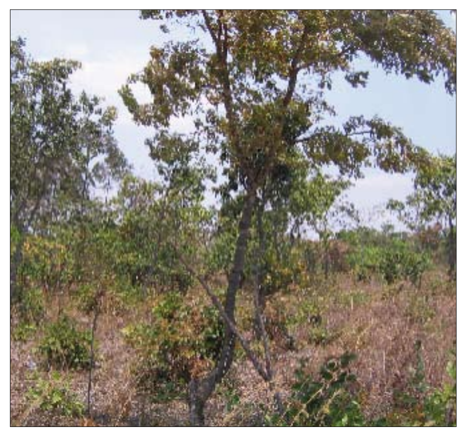
Shifting cultivation: A miombo woodland in the process of regeneneration in Tanzania

Mixing or intercropping maize was a common practice. It promoted efficient labour utilization and lessened the risk of total crop failure since the chances were that if one of the crops succumbed to stress others would survive. Mixed cropping or intercropping stabilized yields, preserved the soil and made it possible to harvest different crops at the same time. The advantages of those technologies were that there was a reduction in susceptibility of the crops to pests and diseases and a better use of the environment where the combination of species grown had different light requirements or explored different depths of soil.<sup>30</sup> They also tended to provide a complete vegetation canopy, 30 Spedding, C.R.W.1979. An introduction to agricultural systems. Applied Science Publishers Ltd