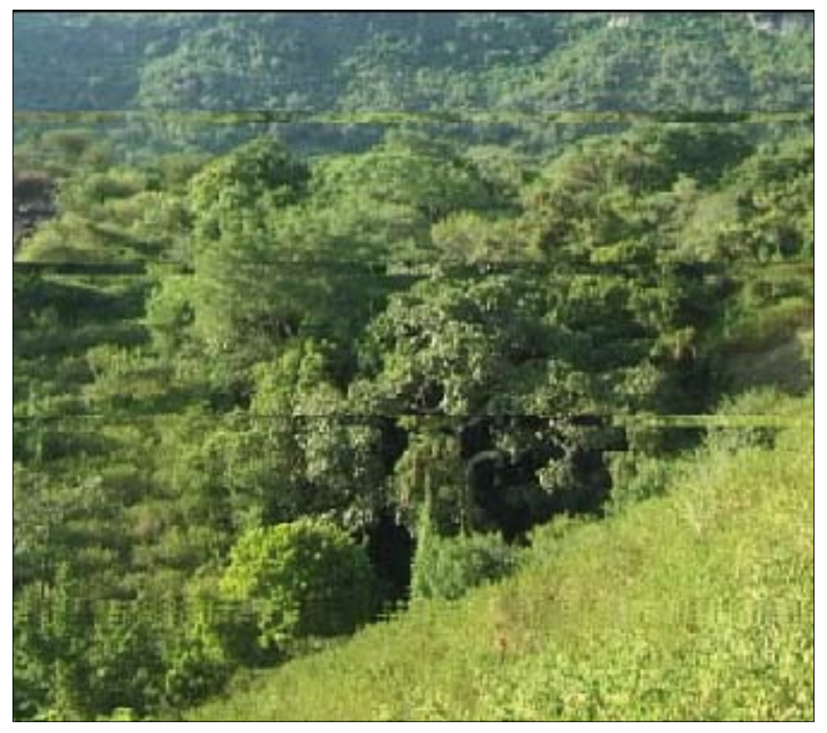
In western Kenya communities had rules to protect forests associated with rivers and streams, which they recognized as shrines. This forest cover protects River Chalua in Mfangano. The forest itself was protected by strong traditional rules and prohibitions. The river is still intact, while others have disappeared where the forest cover was not protected.

as Kenya's Nyanza Luo and Suba Abasuba, Western Banyala in Budalang'i, Coast's Pokomo and Mijikenda along the Tana River and the Swahili people along the Indian Ocean, have used water resources as the basis for their livelihood. The practices and technologies these communities have adapted were geared towards sustainable harvesting of the aquatic resources. The communities in the Lake Victoria basin, for instance, had rules for fishing to ensure sustainable harvesting of fish from the lake. There were strict rules on sizes of nets, types of traps and methods of fishing for specific periods of the year. Any young fish caught by mistake was thrown back into