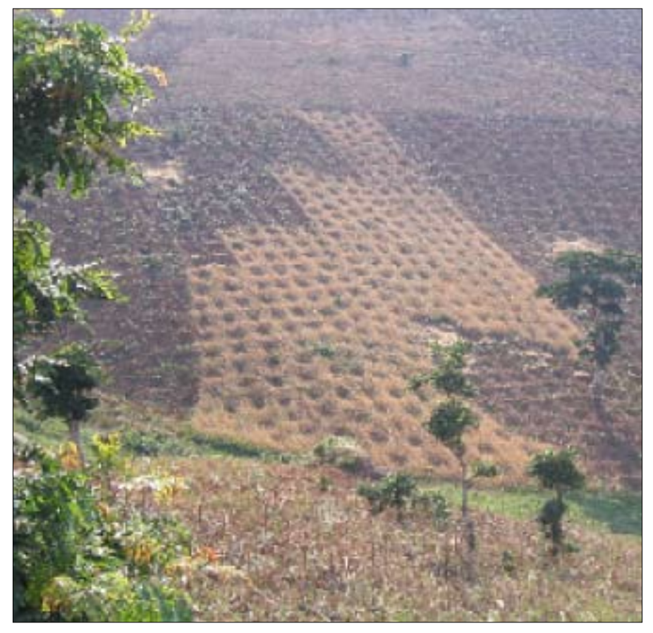
The Matego people of Tanzania practised the ngoro system, an innovation that prevents the destrutive effects of surface runoff in cultivated steep slopes

maintenance techniques because by using these systems farmers also avoid the use of expensive fertilizers.