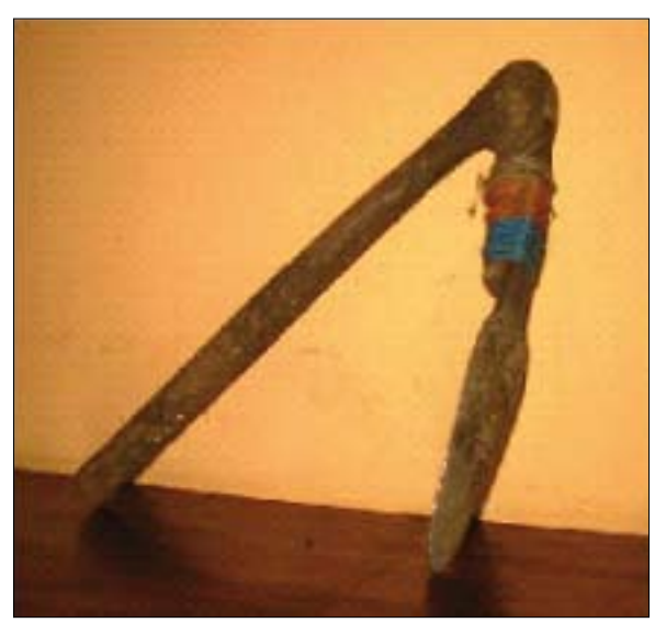
Rapur or kwenyagot, a western Kenya Luo hoe, an example of the simple tools used by traditional communities for cultivation. The tools were not capable of cutting big trees, clearing large tracts of land, or heavy turning of the soil. They left the environment largely undisturbed.

and conserve biodiversity. The strips also serve as sources of medicinal plants and feed for livestock.