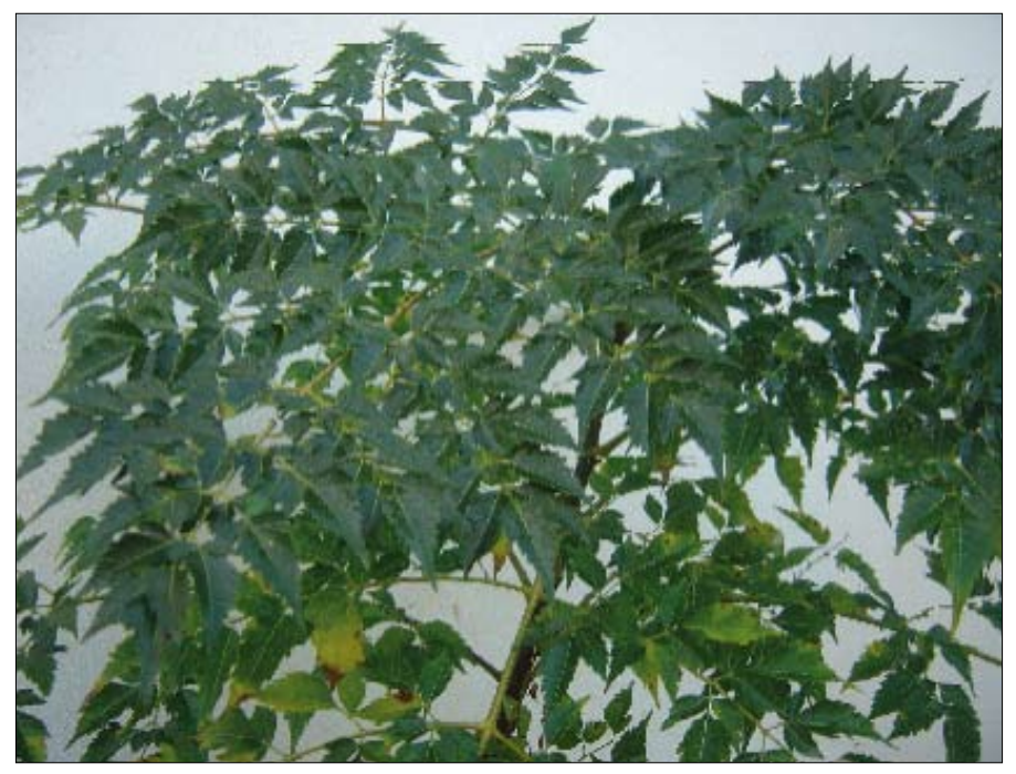
The leaves of the umsilinga (Melia azedarach)are used by the Swazis to prepare medicine for vomiting, running stomach, ulcers, high blood pressure, de-worming dogs and treating wounds in livestock.

companies who have been accused of using the knowledge of the traditional healers to develop new drugs without giving them a fair share of the profits. This breach of intellectual property rights is of great concern not only in Swaziland but also in all the other three countries studied.