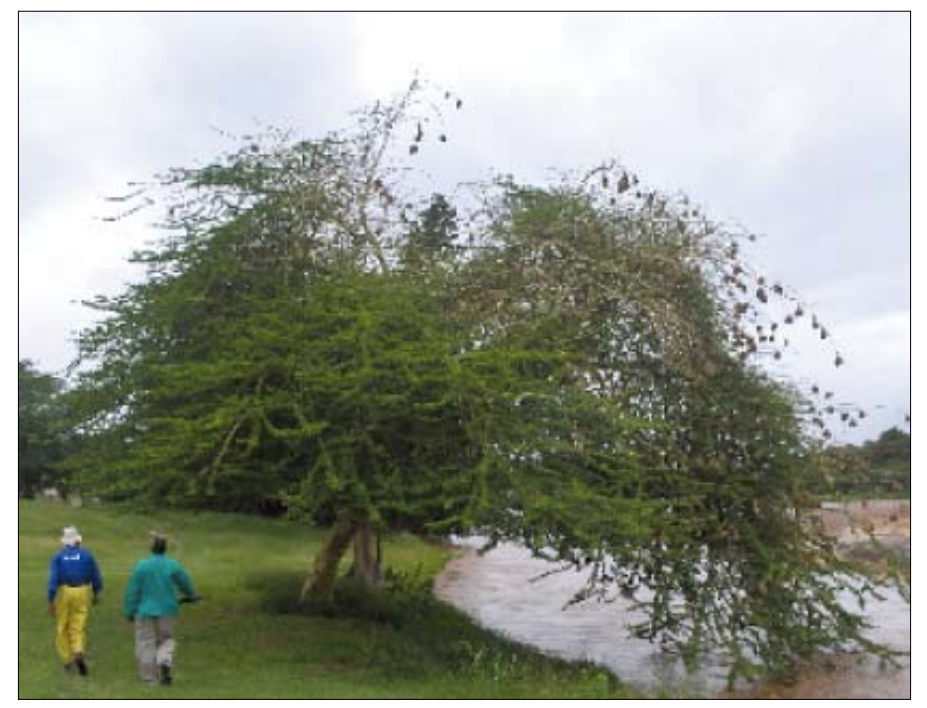
One of the early warning of coming floods is the height of nests of the emahlokohloko bird in Swaziland. When floods are likely to occur the nesting is very high up the trees next to the river and when floods are unlikely the nests are low down.

warriors that could be used to investigate a particular phenomenon or to pass on urgent messages upon need."