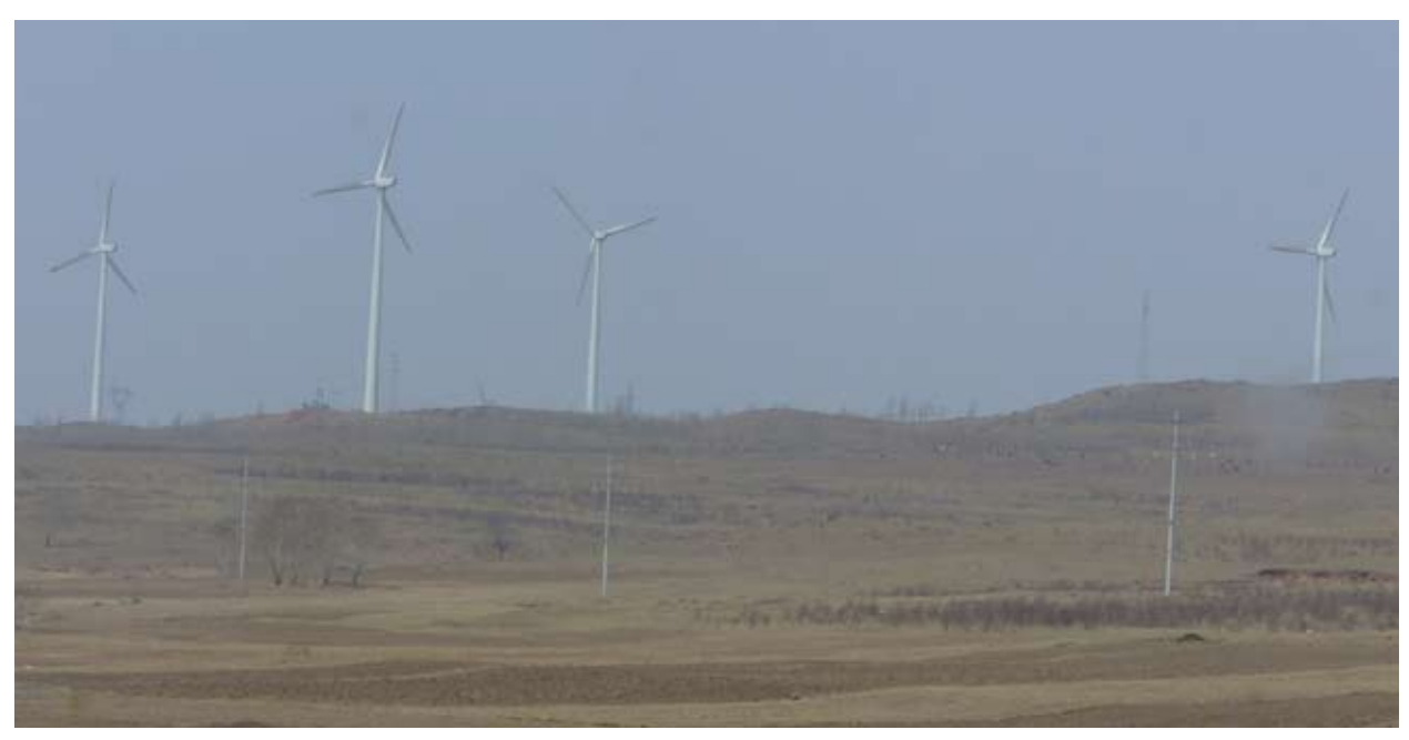
Zhangbei Wind Project provides clean energy in PRC, L. Sorkin 2009.

ADB will invest in sustainable urban transport infrastructure in Ulaanbaatar in Mongolia and in selected cities in the PRC to minimize increases in CO_2 emissions from the urban transport sector. Urban investments will continue to promote low-carbon growth and improve environmental management in cities by reducing methane emissions in wastewater treatment, wastewater sludge management, and in landfill gas recovery as components of urban waste management, and where appropriate, formulate CDM projects. In partnership with the Clean Air Initiative for Asia and others, ADB will further increase investments—such as those planned for Gansu Baiyin, Guangxi, and Xinjiang in the PRC—that yield local health benefits and global climate benefits.