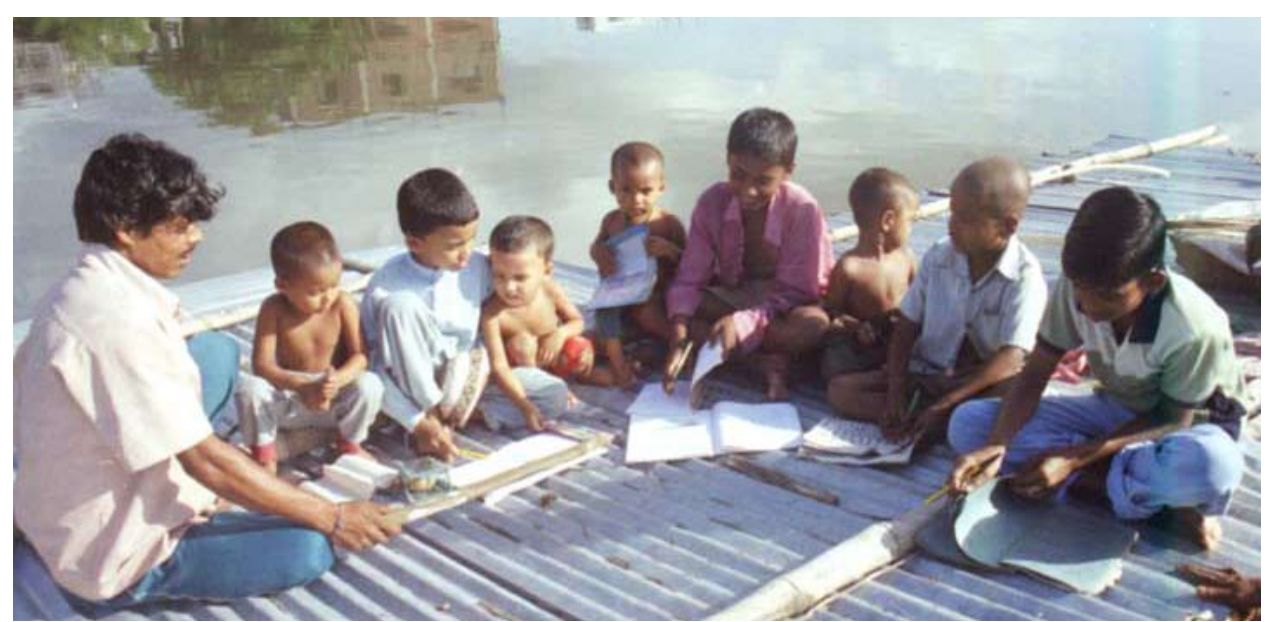
Despite flooding, education continues on rooftops in Bangladesh, ADB Photo Library 2008.

At the South Asian Association for Regional Cooperation (SAARC) ministerial meeting held in Dhaka in July 2008, leaders released the draft Dhaka Declaration on Climate Change and adopted a 3-year action plan. The declaration stressed the need for close cooperation through exchanging information (e.g., disaster preparedness, climate change impacts), building capacities, developing CDM projects, and raising advocacy and mass awareness about climate change. It also urged the international community to provide additional financial resources. The action plan focuses on seven thematic areas, including adaptation, mitigation (sharing of best practices in energy, waste management, transport, sustainable forestry, and CDM capacity building) and a common regional stance in international negotiations.