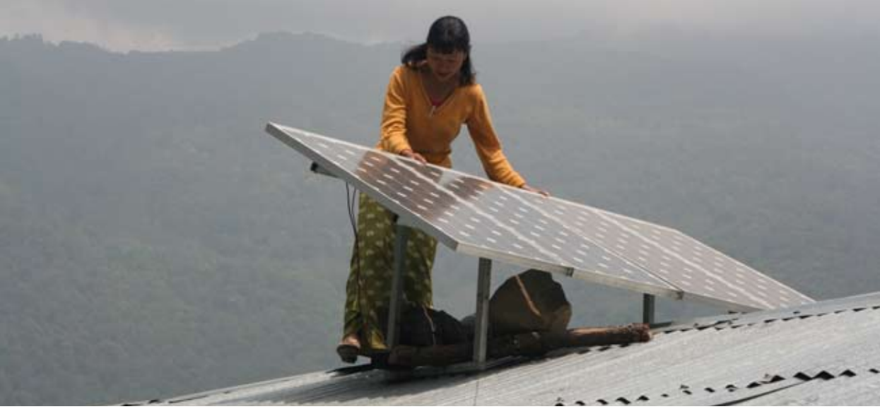
Solar installations provide clean, reliable energy to households, ADB Photo Library 2009.

In demographic terms, South Asia is the region most vulnerable to climate change in the world. Not only do nearly half of the world's absolute poor people live in South Asia, the sheer numbers of small farmers, as well as settlements on South Asia's long coastline, leave hundreds of millions in ADB's South Asia Region at risk. While ADB's six DMCs in South Asia—Bangladesh, Bhutan, India, the Maldives, Nepal, and Sri Lanka—have made notable progress in terms of accelerating their economic growth,<sup>33</sup> recent macroeconomic events have shown that they continue to be vulnerable to external economic shocks. The global economic downturn has weakened their fiscal positions, lowered economic growth projections, and decreased resources available to governments to deliver basic services and develop much-needed infrastructure.