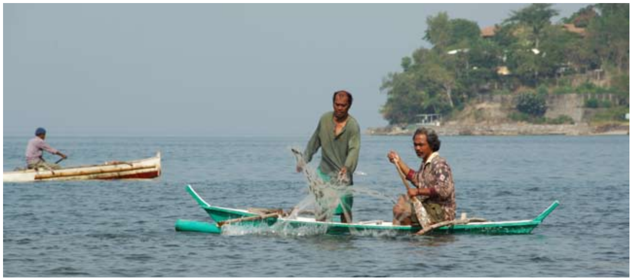
Coral Triangle Initiative builds adaptation capacity in the Pacific, ADB 2009.

Despite variation across countries in the region, ADB's Pacific Region is not keeping pace with the economic growth of its Asian counterparts or with high population growth rates. Sluggish growth is preventing peri-urban populations and those left behind on outer islands from meeting basic needs. While data are not definitive, more than 25% of the populations of Fiji Islands, Kiribati, the Federated States of Micronesia, Papua New Guinea, Solomon Islands, Timor-Leste, and Vanuatu are believed to be living in poverty (ADB 2004). Compounding these development challenges are the serious socioeconomic, environmental, physical, and cultural consequences of recent changes in climate. Increases in high-sea-level events (e.g., storm surges), rainfall and other extreme weather events, drought, air and sea temperatures, water shortages, and erosion are causing significant economic and related problems for all sectors of the island economies and societies. In the absence of prompt and substantial reductions in global greenhouse emissions, these and new impacts will undoubtedly become even more serious in the future.