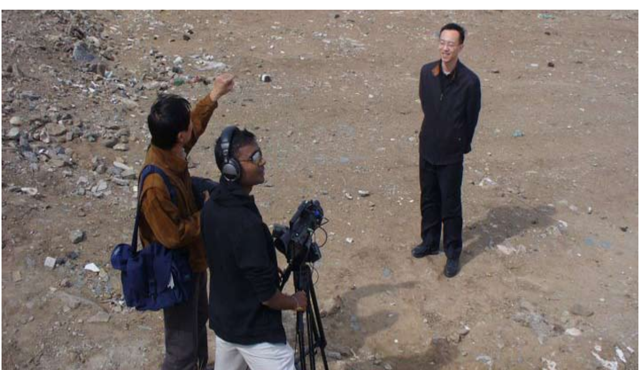
ADB and Asia Pacific Broadcasting Union work with a TV journalist in PRC on a Climate Change Story

the public with up-to-date information on proven solutions to climate challenges.