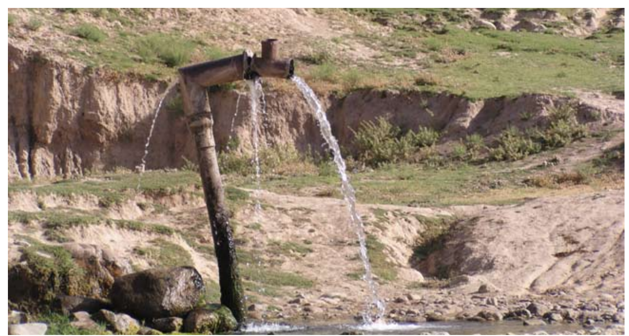
Irrigation system in need of upgrade in Central Asia, R. Everitt 2009.

Policy and institutional support. In Central Asian countries, the water–energy nexus is a key issue, with conflicting energy and irrigation needs and major international tensions. Integration and expansion of existing ADB regional projects in Central and West Asia can address these issues in the context of regional water and land resource management, while leading to multiple adaptation