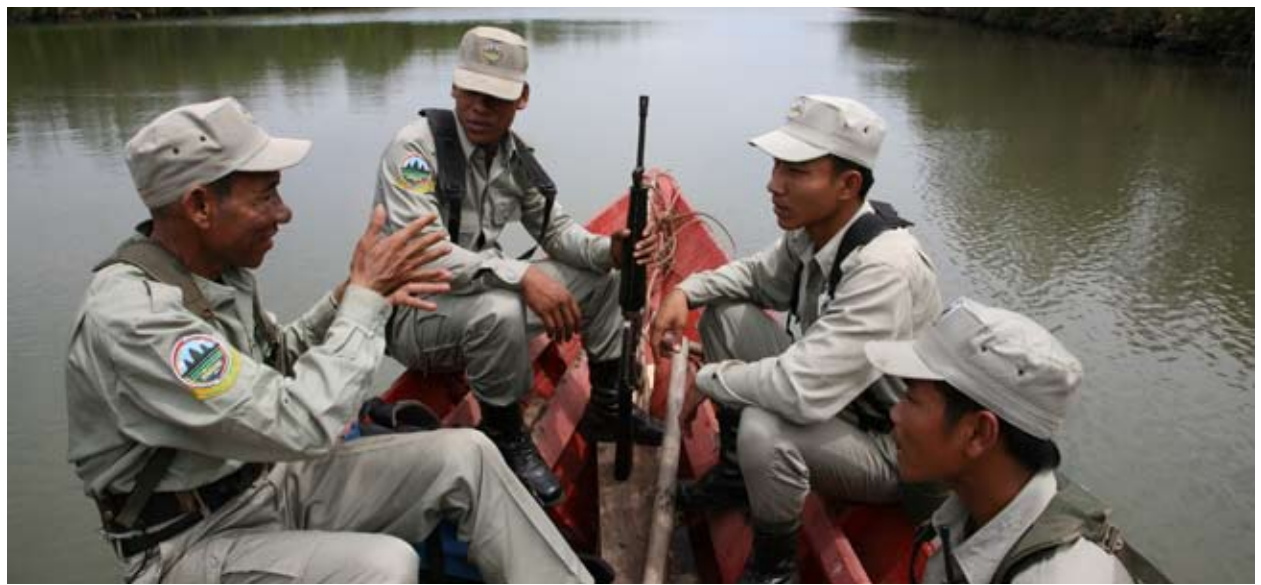
Forest rangers on patrol in Cambodia, S. Griffiths 2008.

reduce greenhouse gas emissions simultaneously through improving land use and forest management, developing biofuels, improving urban sanitation, decreasing air pollution, and improving water management. In the short-term, ADB will mobilize investments to address climate change concerns in water supply and sanitation in all of its Southeast Asian member countries. It will enhance investments in specific land and marine resource management projects in Indonesia and the Philippines to protect forests, fisheries, and coral reefs to address both mitigation and adaptation. In Viet Nam, ADB will invest in air pollution reduction initiatives which will have co-benefits for climate and health. ADB will also work with other donor partners to increase investments in sustainable agriculture to decrease greenhouse gas emissions from farming, while increasing livelihood security.