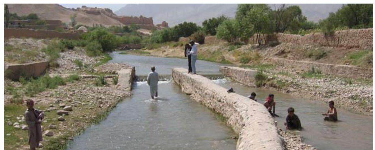
Water resources in Afghanistan, critical to every day life are threatened by climate change, F. Radstake 2008.

Central and West Asia is a large region of varied geography, culture, and economic opportunity. The natural environment includes high mountain passes, vast grasslands, and large internal water bodies—including the Indus, Amu Darya, and Syr Darya river basins and the Caspian and Aral seas—all of which are essential for agriculture, trade, and energy production. The economies of Central and West Asia are recovering, despite a period of slowed