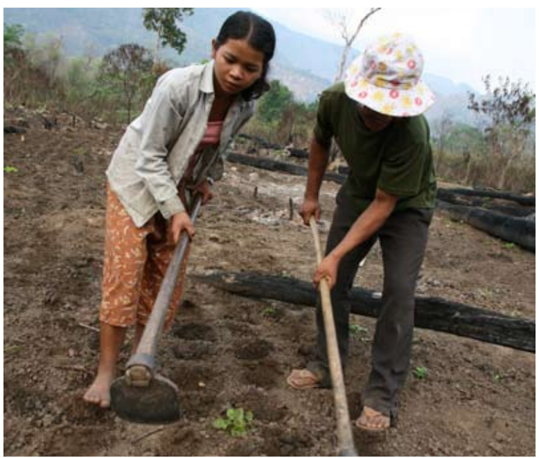
Women plant new species in Lao People's Democratic Republic, S. Griffiths 2008 .

Despite rapid growth over the last decade,<sup>39</sup> more than 44% of the population of Southeast Asia lives below the $2 per day poverty line. Across the region, cities are expanding and the urban population is expected to increase to more than 402 million by 2025.<sup>40</sup> While urban employment is rising, the vast majority of people in the region are directly dependent on natural resources for their livelihoods. Despite declining contributions to GDP, the agriculture and forestry sectors continue to employ a significant proportion of the labor force—more than 45% in 2004. Further, a great many more people derive their livelihoods from coastal and marine resources.