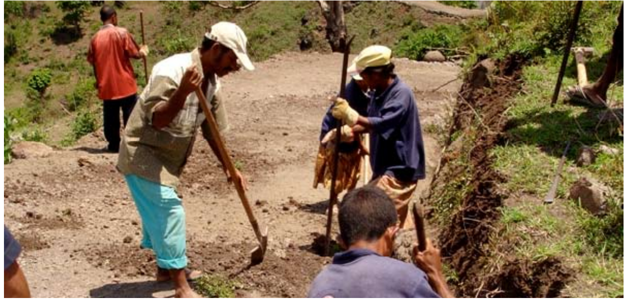
Improving roads in the Solomon Islands, R. Guild 2008.

In 2005, ADB's Pacific Department (PARD) adopted Guidelines on Adaptation Mainstreaming in PARD Operations .<sup>30</sup> The department has already identified possible modifications that will climate-proof ongoing projects and incorporate climate-resilient design for new projects. In the future, ADB will place much greater emphasis on adaptation, and on new assistance to capture the synergies between adaptation and mitigation, and between disaster risk reduction and climate change adaptation. In the Pacific the sectors where addressing climate-related risks is of highest priority are (i) infrastructure and human settlements,