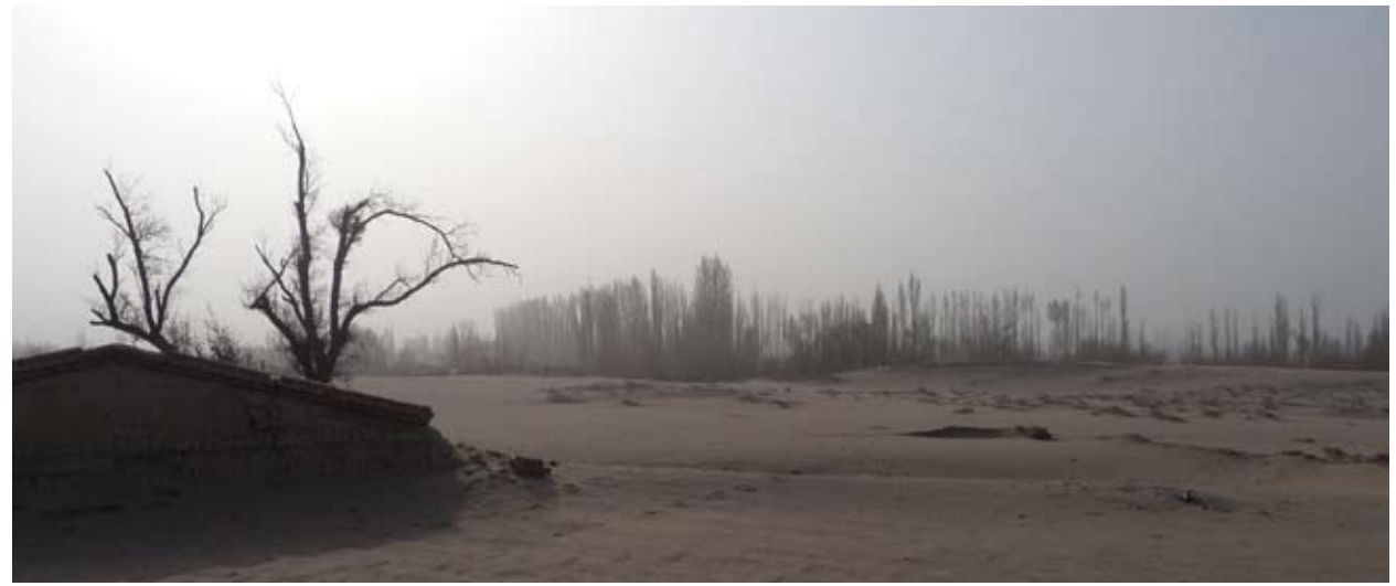
Desertification in Xingjiang, PRC F. Radstake, 2008.

ADB's East Asia Region is made up of two very different countries: the People's Republic of China (PRC), an economic and population giant with largely a coal-based economy; and Mongolia, a country with barely 0.2% of the PRC's population but with a combination of location, resource endowments, and economic structure that make it highly vulnerable to the impacts of climate change. Both countries have witnessed fast economic growth in recent years, although it is more rapid and broadly based in the PRC than in Mongolia. Economic growth has led to significant reductions in poverty in both countries, but the reduction is deeper and more sustained in the PRC than in Mongolia. Greater energy production has accompanied much of the PRC's economic growth but, given the high share of coal in energy production, this has placed the PRC on a high-carbon development path. In Mongolia, the revival of economic activity during recent years has increased greenhouse gas emissions, although from a very low base. Over the last decade, leaders in both the PRC and Mongolia have become more aware of the likely impacts of climate change on their economies and populations and their ability to adapt to them.