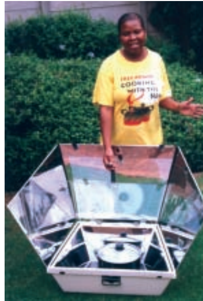
Information dissemination, fashionably. One fan of solar-cooker stoves

In a typical development assistance programme, a donor government would provide funds to a non-governmental organisation (NGO), which would buy an improved cooking device and provide it at low or no cost to users. In Germany, the Gesellschaft für Technische Zusammenarbeit (GTZ) assesses technology