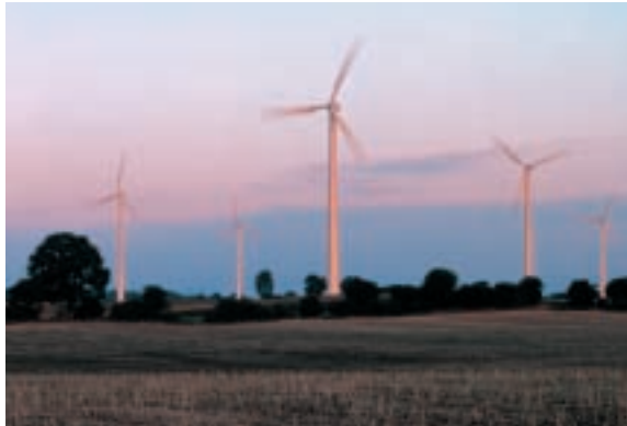
Enron “Wild” 1.5 MW wind-turbine