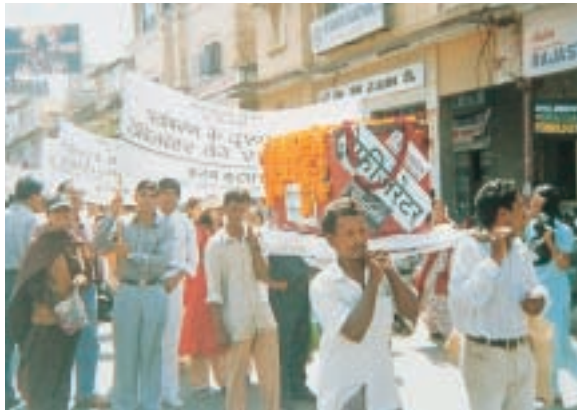
Demonstrators in India hold a “refrigerator funeral” to accelerate the phase out of refrigerators that use CFCs.

The 1987 Montreal Protocol commits its 175 signatory countries to eliminate the use of ozone-depleting substances. Industrialised countries promised to phase out the use of these substances at various times throughout the mid 1990s. The target for developing countries is 2010.