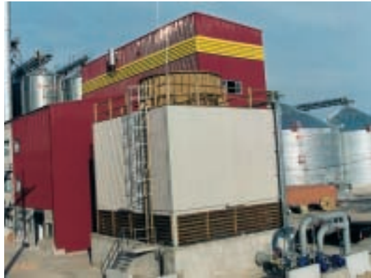
Chia Meng co-generation power station