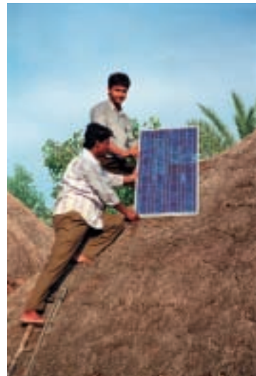
Installing solar panels as part of a new service module

During the 1990s, new tax policies and changes in power regulations improved the investment climate for renewable-energy technologies in India. At the same time, the Indian government, the World Bank and the Global Environmental Facility (GEF) supported a renewable-energy development project to improve the functioning of commercial markets for wind, mini-hydro and solar PV technologies. 30 The project, along with assistance from Denmark and other sources helped the India Renewable Energy Development Agency (IREDA) to promote and finance private investment in renewable energy. IREDA now conducts marketing campaigns, offers business training, provides various types of credit and subsidies and offers other financial incentives.