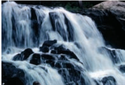
Small waterfall in the Philippines.