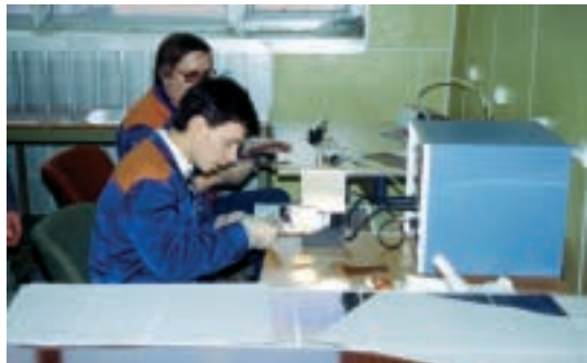
Programme staff analysing data from energy-efficiency audits