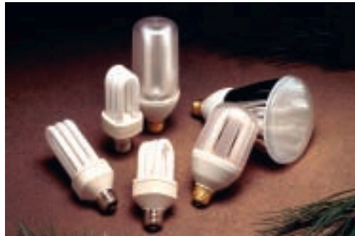
Compact fluorescent lamps