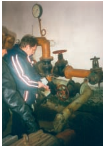
Energy audit of a district-heating system

The project promised environmental benefits for Sweden and the Baltic countries. About 90% of energy systems in the Baltic countries are fossil-fuel based, particularly district heating systems. These heating systems are relatively well developed, but often in poor condition due to lack of maintenance. Many