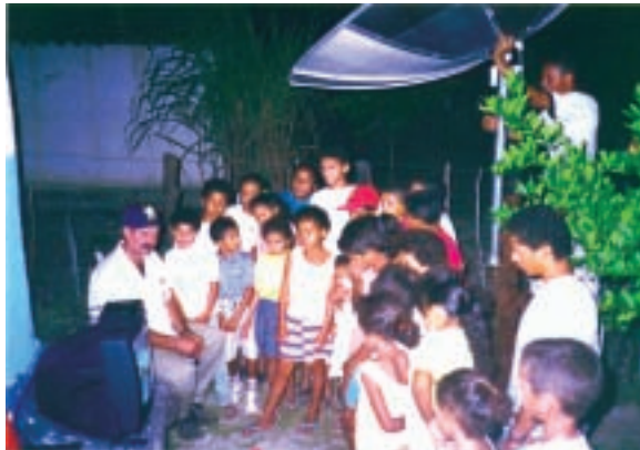
Children watching television powered by renewable energy