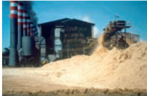
Biomass co-generation power station