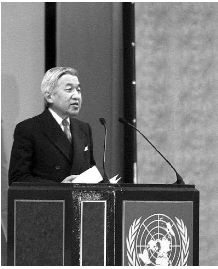
Address by His Majesty The Emperor of Japan at the United Nations World Conference on Disaster Reduction 18 January 2005