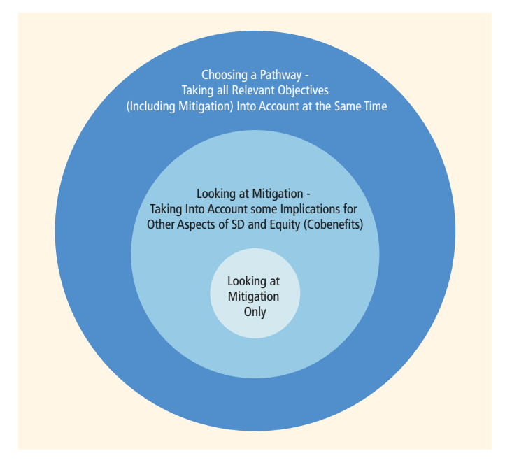
Figure 4.1 | Three frameworks for thinking about mitigation.

The second justification is the legal claim that countries have accepted treaty commitments to act against climate change that include the commitment to share the burden of action equitably. This claim derives from the fact that signatories to the UNFCCC have agreed that: "Parties should protect the climate system for the benefit of present and future generations of humankind, on the basis of equity and in accordance with their common but differentiated responsibilities and respective capabilities" (UNFCCC, 2002). These commitments are consistent with a body of soft law and norms such as the no-harm rule according to which a state must prevent, reduce or control the risk of serious environmental harm to other states (Stockholm Convention (UNEP, 1972), Rio declaration (United Nations, 1992b), Stone, 2004). In addition, it has been noted that climate change adversely affects a range of human rights that are incorporated in widely ratified treaties (Aminzadeh, 2006; Humphreys, 2009; Knox, 2009; Wewerinke and Yu III, 2010; Bodansky, 2010).