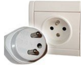
Type E: This socket also works with plug C. Plug F will work if it has an additional pinhole

Delegates are strongly encouraged to carry their own adapters for use with laptops and other electrical appliances as the Secretariat will not be able to provide these. In case of need, adapters can be purchased from shops in the city dealing in electronic and electrical items.