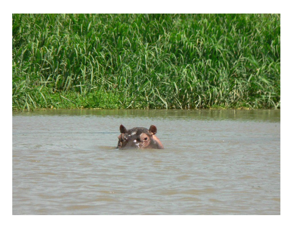
INTERGOVERNMENTAL PANEL ON CLIMATE CHANGE