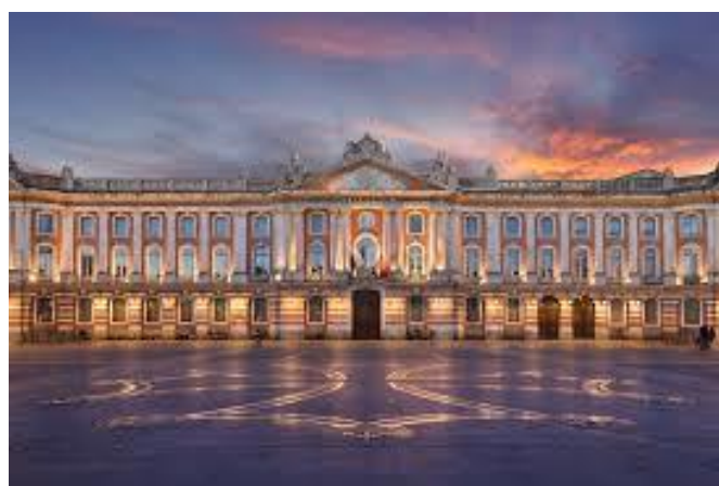
Place du Capitole, Toulouse, France.