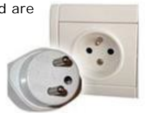
Type E: This socket also works with plug C. Plug F will work if it has an additional pinhole

Delegates are strongly encouraged to carry their own adapters for use with laptops and other electrical appliances as the Secretariat will not be able to provide these. In case of need, adapters can be purchased from shops in the city dealing in electronic and electrical items.