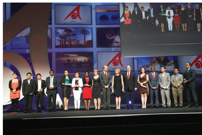
Prince Albert II of Monaco Foundation

Presentation of certificates to the IPCC scholars at the 4th Award Ceremony of the Prince Albert II of Monaco Foundation, Monaco, 7 October 2011 (left). Students receiving certificates at the 6th Award Ceremony of the Prince Albert II of Monaco Foundation, Monaco, 30 September 2013 (right).