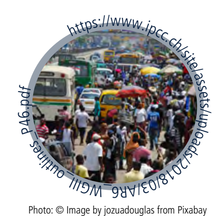
Working Group I